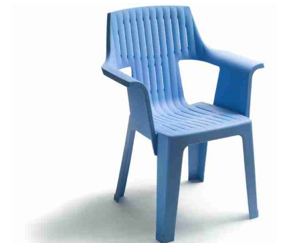
ergonomic stacking chair