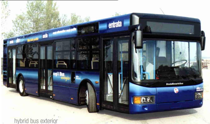
hybrid bus exterior