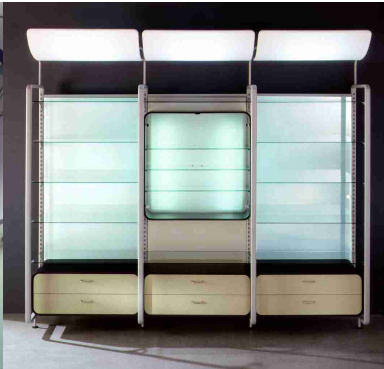
shop display systems