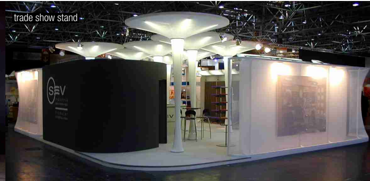
trade show stand