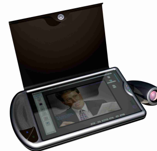
palm - top computer